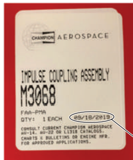
MANUFACTURED DATE LOCATED ON IMPULSE COUPLING REPLACEMENT KIT

THIS DOCUMENT SUBJECT TO THE CONTROLS AND RESTRICTIONS ON THE FIRST PAGE