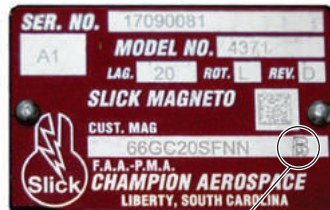
LETTER "B" INDICATES REPAIRED MAGNETO