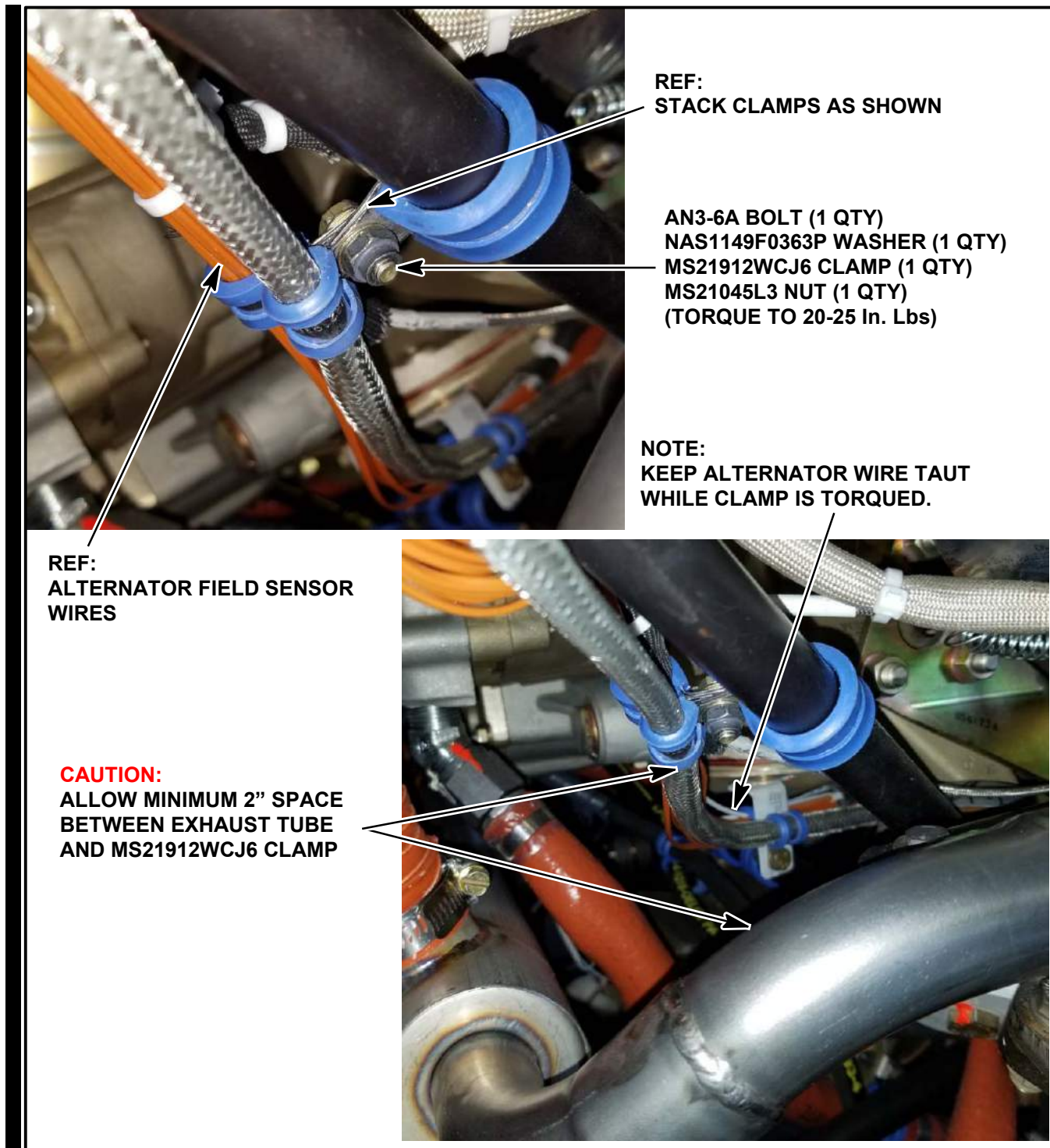
Figure SB M20-340-3 - NEW ALTERNATOR WIRE MOUNTING

THIS BULLETIN DOES NOT CHANGE AIRCRAFT TYPE DESIGN