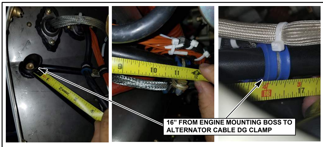
Figure SB M20-340-2 - ALTERNATOR WIRE ROUTING LOCATION (RH ENGINE MOUNT)