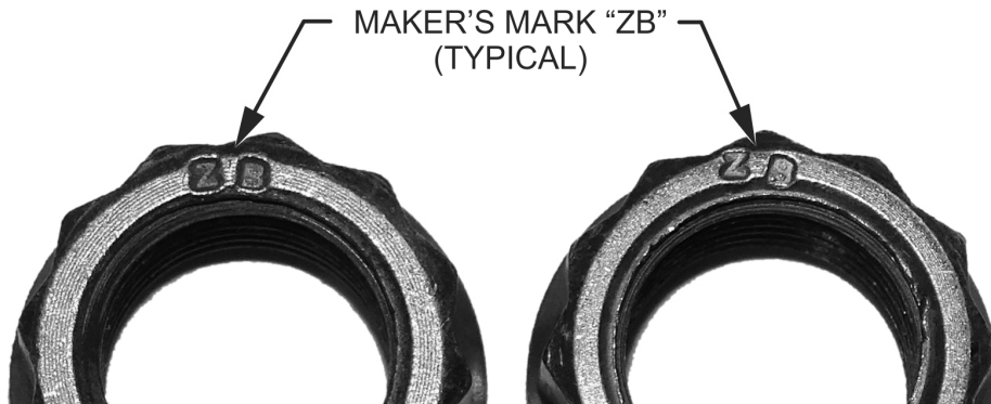
Figure 1. Flanged Nut, Manufacturer’s Stamp, (maker’s mark, affected)